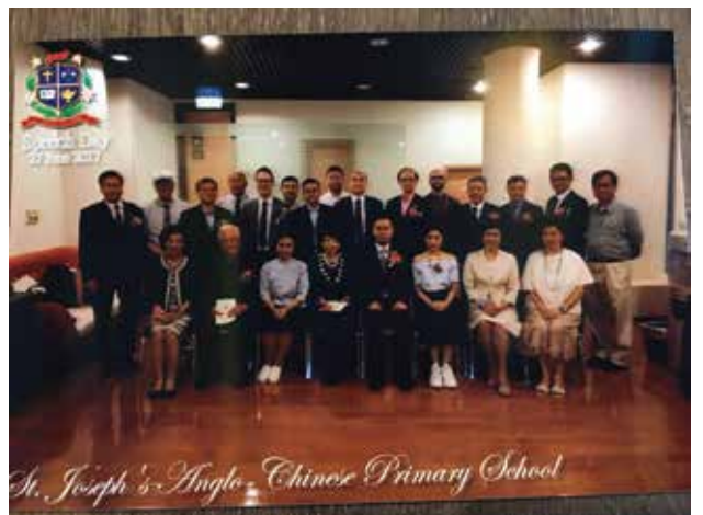
St. Joseph's Anglo-Chinese Primary School