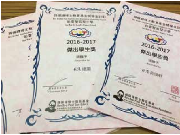
The Little Flower's Catholic Primary School