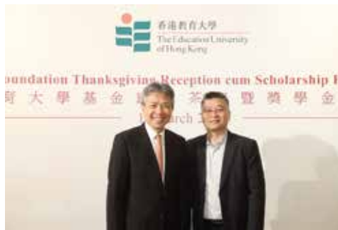
Attending EdUHK's Thanksgiving cum Scholarship Ceremony