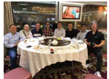
Patron visit from Canada