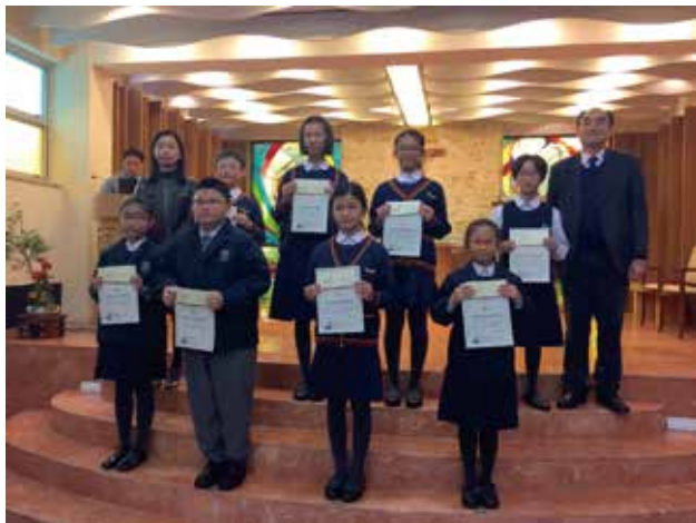
Saint John The Baptist Catholic Primary School