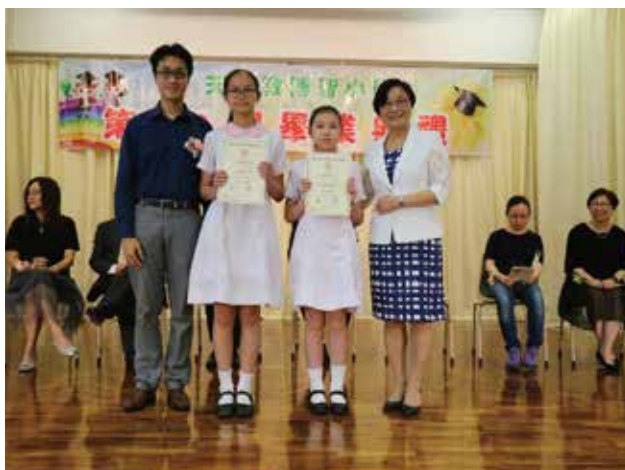
Price Memorial Catholic Primary School