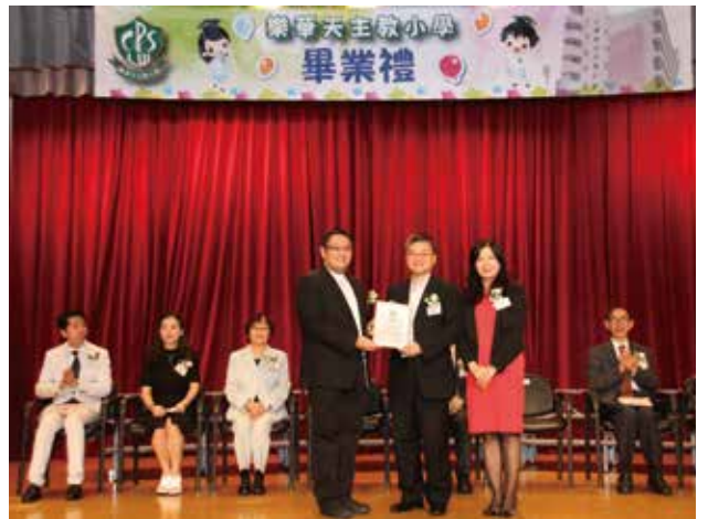
Lok Wah Catholic Primary School