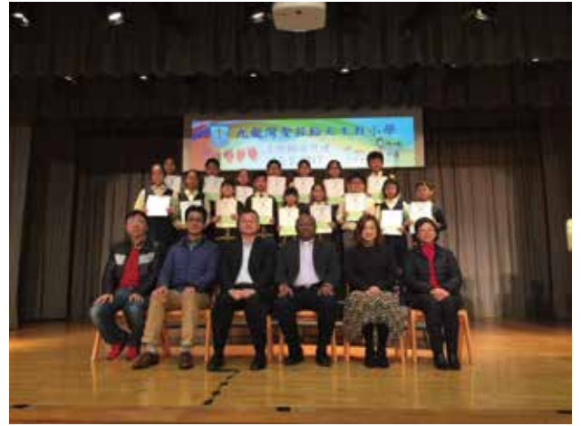
Kowloon Bay Saint John the Baptist Catholic Primary School