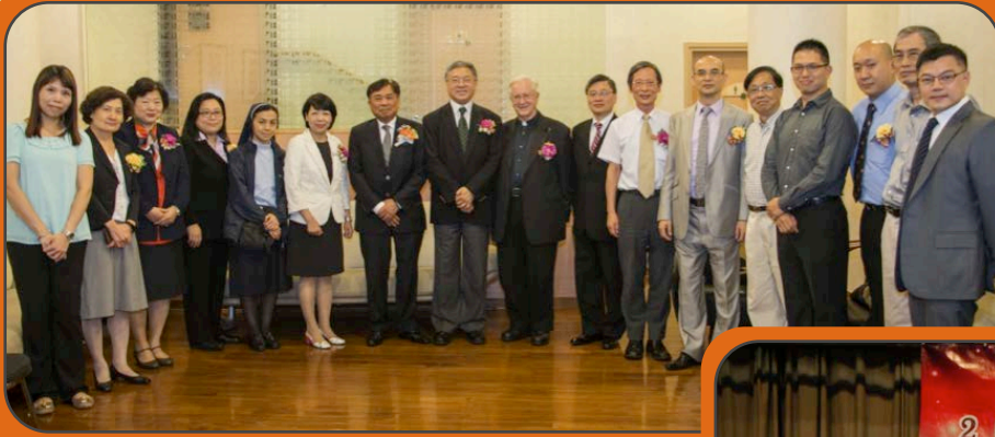
SJACPS speech day