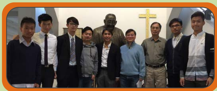
This year's applicants with trustees of the Foundation and scholarship donors

There is an annual scholarship award presentation ceremony on campus to honor the successful candidates in the presence of the entire school. Each is awarded a Certificate of Honor and a cheque for HK$10,000. A Roll of Honors will soon be put up in the Rev. Bro. Paul Sun Memorial Hall that will display the names of the various scholars and the awards won. The express aim is to instill a sense of pride in academic achievement and to encourage students to follow such fine examples – true to the school motto: Ad astra!